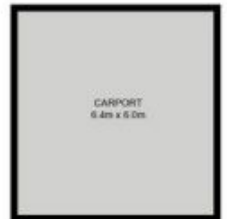
CARPORT 6.4m x 6.0m

Whilst every attempt has been made to ensure the accuracy of the floor plan contained here, measurements of the doors, windows, rooms and any other items are approximate and no responsibility is taken for error, omission or mis-statement. This plan is for illustrative purposes only and should only be used as such by any prospective purchaser. The services systems and appliances shown have not been tested and no guarantee as to their operability or efficiency can be given.